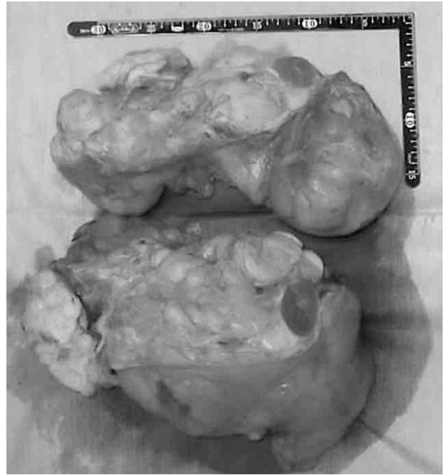
Fig. 2. Macroscopic findings of the tumor. The mass measured twenty by thirty-four centimeters and 4.3 kilograms. Cut surface of the tumor, showing soft yellow fat-like part and firm whitish part.

The medical treatment against acute pancreatitis was done firstly with antibiotics and the inhibitor for pancreatic enzyme. After the patient recovered from that, the surgical resection of the tumor with the right kidney and the right adrenal gland through a full-length right pararectal incision with subcostal arch incision was done successfully en bloc. In the operative findings, the huge retroperitoneal tumor displaced the right colon anteriorly and medially and compressed the duodenum. The tumor extended along the peripancreatic space. The mass measured twenty by thirty-four centimeters and 4.3 kilograms. This tumor contained soft yellow fat-like part and firm whitish part (Fig 2). Microscopically, the tumor was composed of bizarre cells (Fig 3a). The tumor cells were positive for vimentin staining (Fig 3b) desmin staining (Fig 3c) and alpha smooth muscle actin staining (Fig 3d). The postoperative pathological diagnosis showed dedifferentiated liposarcoma. The postoperative course