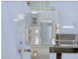
Figure 2. STG-55 (Nikkiso), equipped with a disposable and modular tubing circuit with an auto-priming function, automatic calibration with quick response in the sensor set-up, and a compact structure.

Concept Target: Acute phase (Operation room & ICU) ▪ Simple handling ▪ Short preparation time ▪ Down sizing & slimming