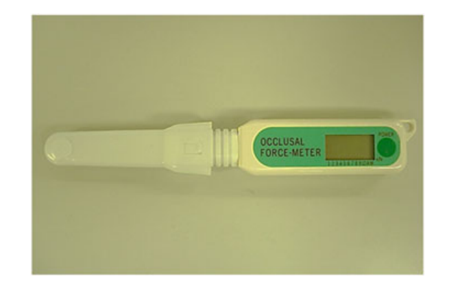
FIGURE 2 Occlusal Force-meter GM10 (Nagano Keiki Co. Ltd., Tokyo, Japan)

biting. The larger measurement achieved on each side was regarded as representative, and the mean value of bilateral representative measurements was used as the MBF of the individual.