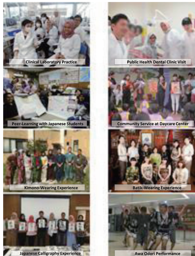
Fig. 5 Memorial photographs on student exchange program.