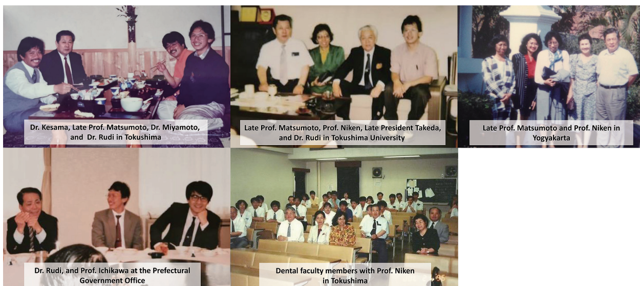
Fig. 1 Memorial photographs of the early days before academic agreement with Indonesian University.

University, Graduate School of Dentistry, in April 1993. In those days, TUD had few international students.