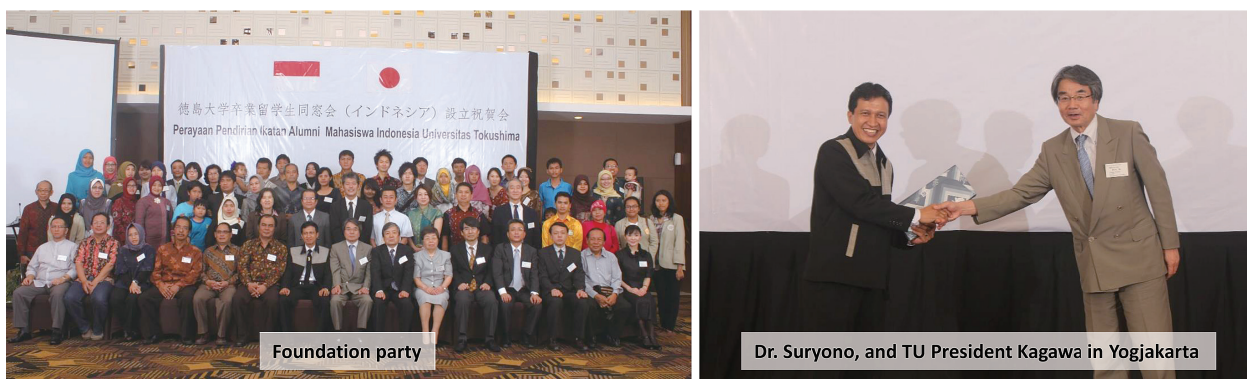
Fig. 6 Memorial photographs of Indonesian Alumni Association of Tokushima University.

true that the ability of Indonesian students are higher than that of TUD students. TUD students as well as TUD faculty have a great deal to learn from Indonesian students. As data confirm that fewer young Japanese researchers are studying abroad, the internal focus of Japanese researchers is raised up for the researcher level. Indonesian researchers would be enterprising and open-minded compared to TUD researchers at present, but there are still many accumulated know-how and skills in the TUD to learn for Indonesian researchers. Physical and moral stimuli from Indonesian researchers could activate the research minds of TUD researchers.