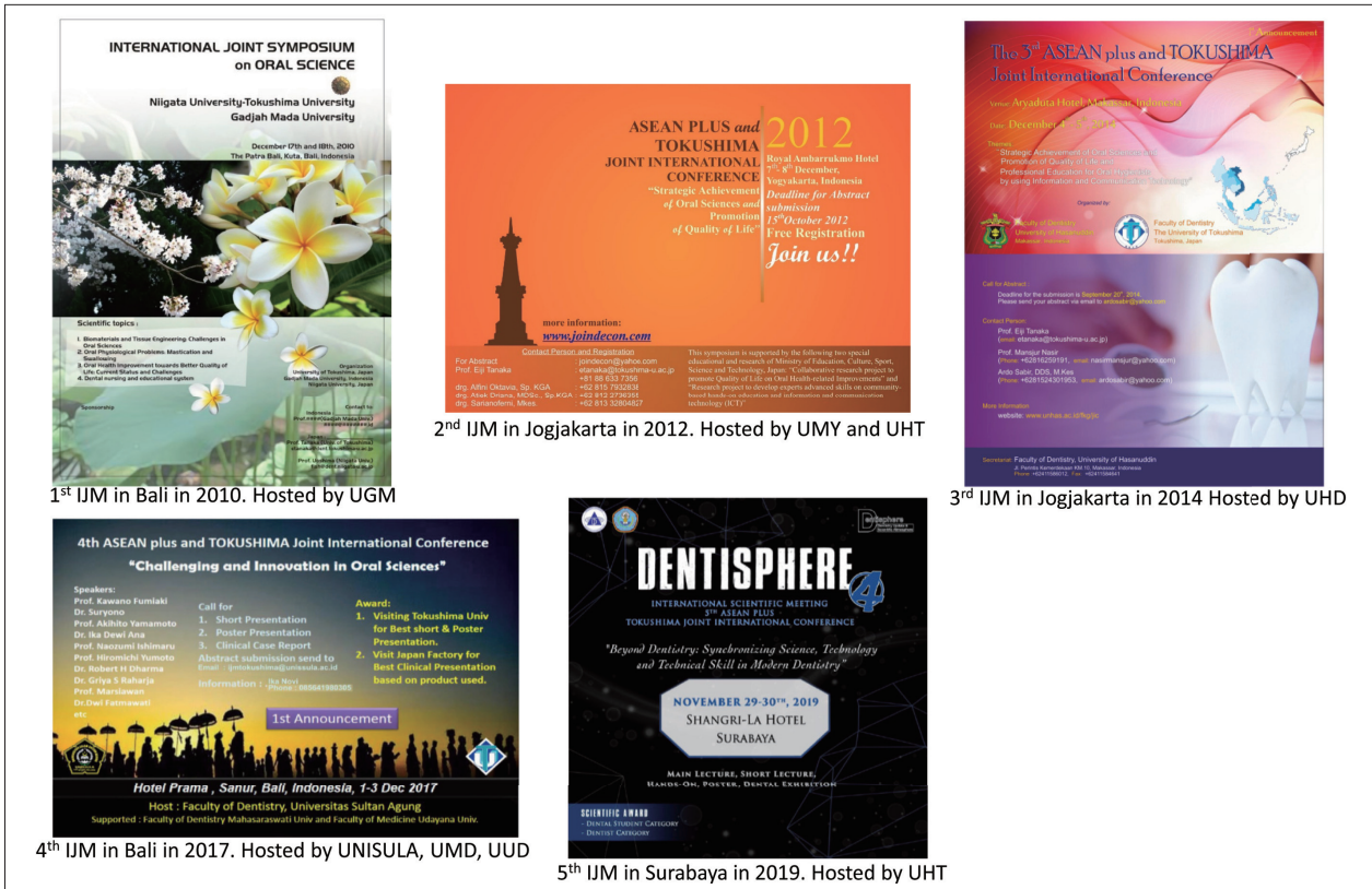
Fig. 4 Fliers of the five international joint meetings (IJMs).